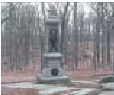
COVER: The recently cleared area around Bushman Lane on the Gettysburg battlefield.